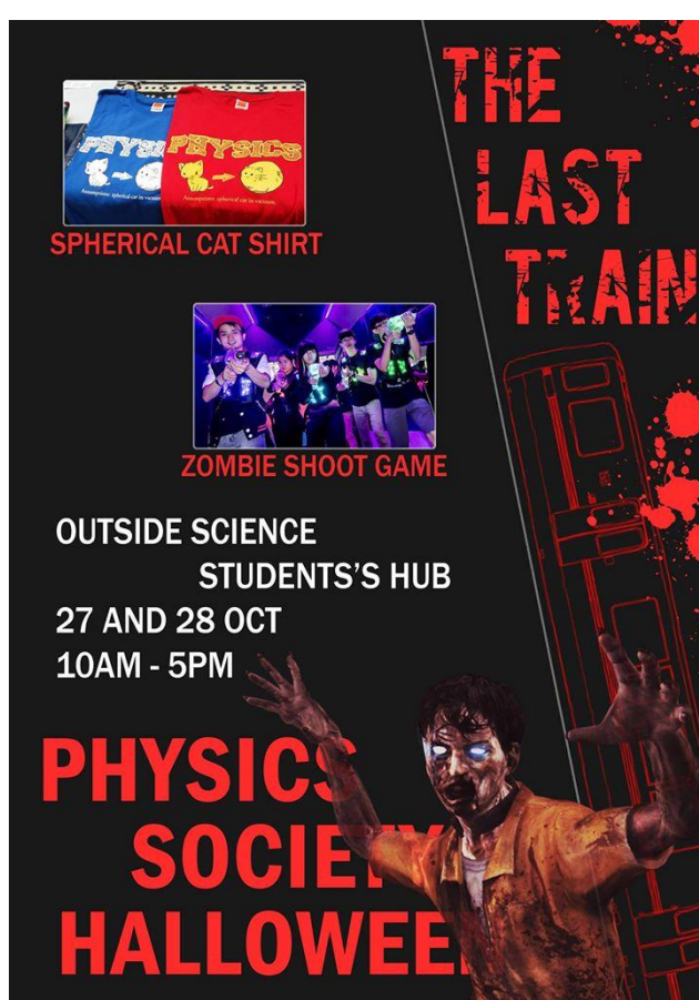
Publicity Poster for PhySoc

On 27th and 28th October, Science Club organised its annual Halloween event for the Faculty of Science (FoS). Student-led clubs and society under FoS were invited to set up booths along the walkway near the newly opened Science Student's Hub. The theme for this year's Halloween was 'The Last Train', inspired by the well-received movie 'Train to Busan'. Apart from the manning of booths, areas around our familiar campus were given a temporary facelift to create an atmosphere befitting of the event.